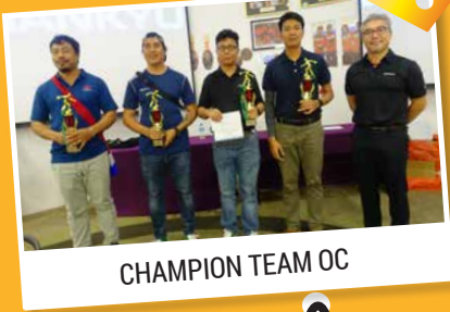
CHAMPION TEAM OC