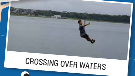
CROSSING OVER WATERS