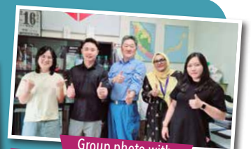
Group photo with Sankyu JB Management Staff