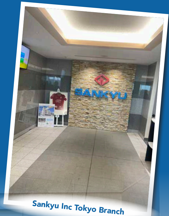
Sankyu Inc Tokyo Branch