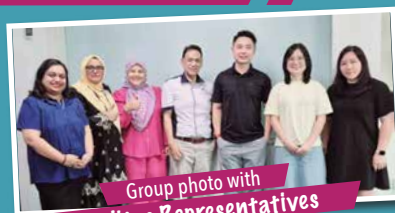
Group photo with Qualitas Representatives

Looking forward to a great collaboration with Qualitas.