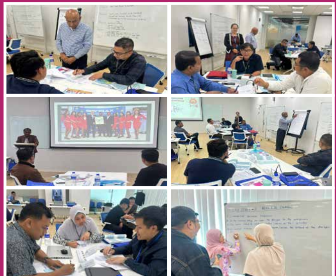
Engaging and Fun Classroom Lessons