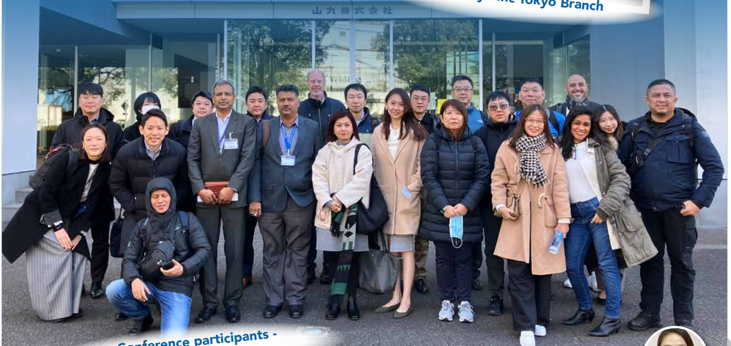
Conference participants - head office