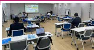
STA Classroom Lessons